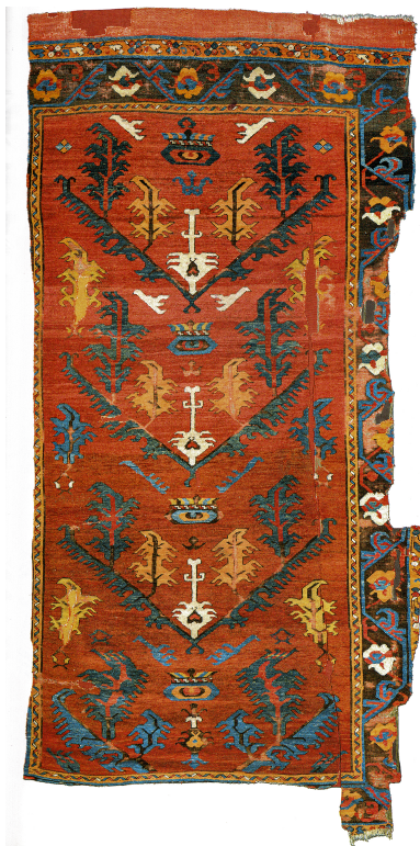
Flaming Animal Spirit Carpet with Vultures

Perhaps one of the most interesting carpets discovered in recent times. It appears to represent a series of giant winged figures, on which animal spirits are dancing or hovering. One of the most striking things is the movement of the figures which I call the flaming animal spirits. 2