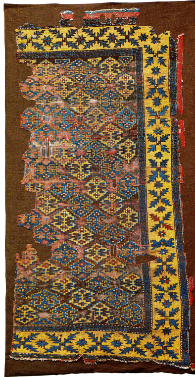
Endless Repeating Design with Blue Leaves on a Yellow Border

Here we have dazzling color and brilliant egoless form. This deceptively simple carpet, its very fine weave, subtle coloration of brown yellow and blue which is almost Seljuk in quality, the finesse of the design—all suggest a 15 th century date. The design is particularly interesting since an endless repeat—in any form—is the most fundamental structure of centers that there is, and the most fundamental way of making wholeness in the plane.