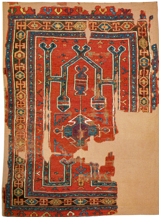
Seljuk Prayer Rug

This carpet, possibly the only surviving single-niche prayer carpet of the Seljuk era, is a close counterpart of the famous 15 th century white field saph in the Turk ve Islam Museum. What is important about this carpet, and certainly most striking, is what we might call its “being nature.” When we look at this carpet, we are unaccountably, but quite definitely confronted with a being.