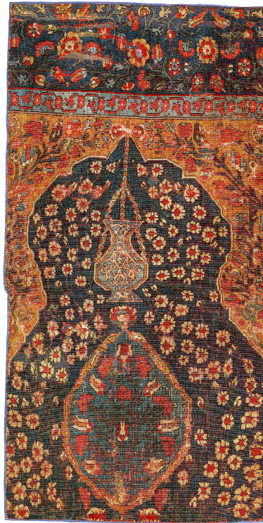
Saph Mihrab with Plum Blossoms

This single mihrab from a large saph comes from the same saph as the other single mihrab now in the Turk ve Islam Museum and the three niche fragment in the Textile Museum. Tile works of similar sprays of plum blossoms were almost exclusively made in the 16 th century. The beauty of geometrical tracery and line, which produced wholeness so strongly in the earlier 15 th century carpets, is still visible in the drawing of the lamp.