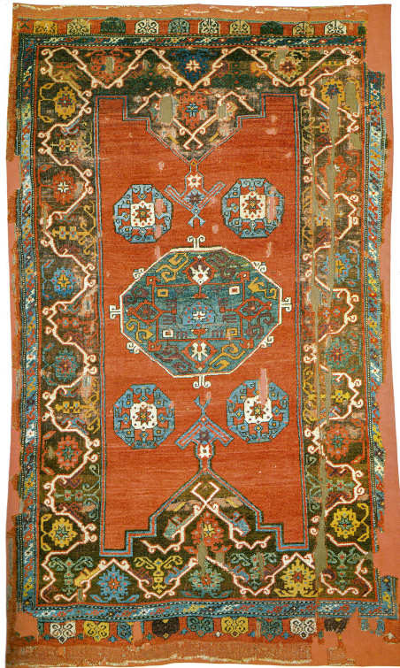
Waving Border Carpet

This almost completely preserved carpet of the 15 th century is one of the most powerful in the collection. . . . [A]rtistically, the carpet achieves something very unusual in the field of centers. The centers are more animated than in most early carpets, as though an endless waving motion creates the stillness at the center. The wave of the border, the astonishing symmetrically placed wave elements, vibrates to create the main feeling of the carpet.