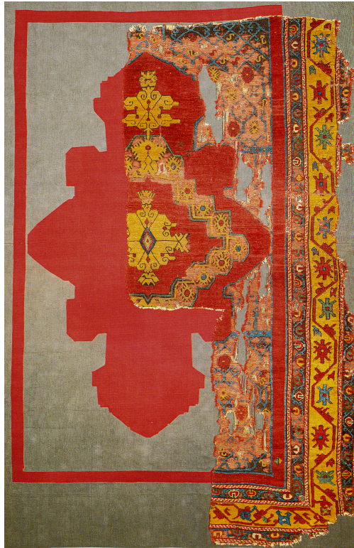
Archaic Lobed Medallions Carpet with Turtles in the Border

Most important of these [important features] is the fascinating shape of the main medallion. This medallion, which occupies almost the whole carpet, has an extraordinary “being” quality and shape. Of all the shapes I know in the world of design—carpet motifs, buildings, and other forms—it is one of those, which contains the being quality to the greatest degree.